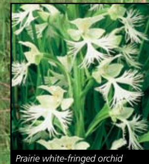
Prairie white-fringed orchid