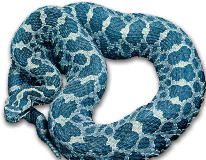
Eastern massasauga rattlesnake