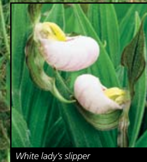
White lady's slipper