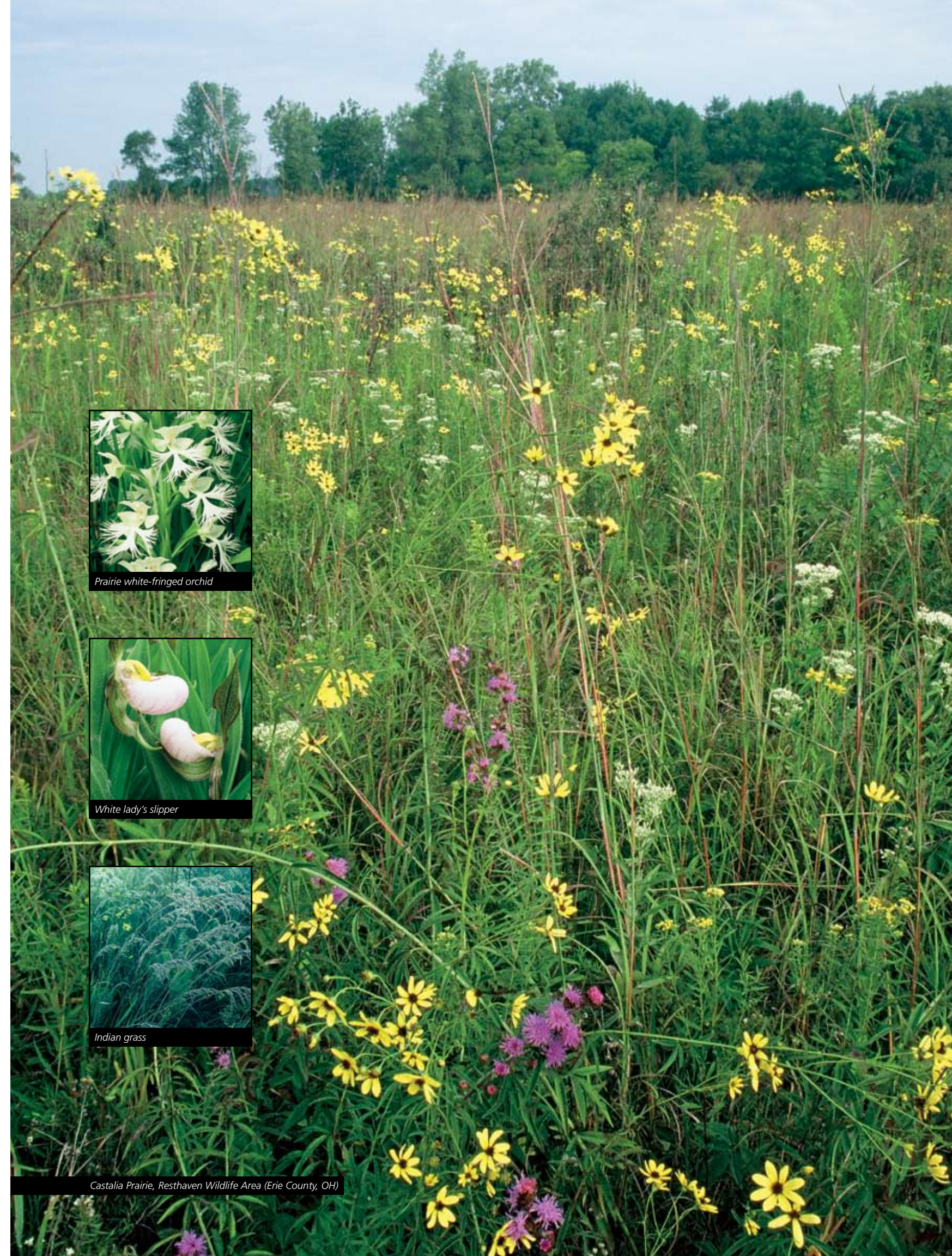
Castalia Prairie, Resthaven Wildlife Area (Erie County, OH)